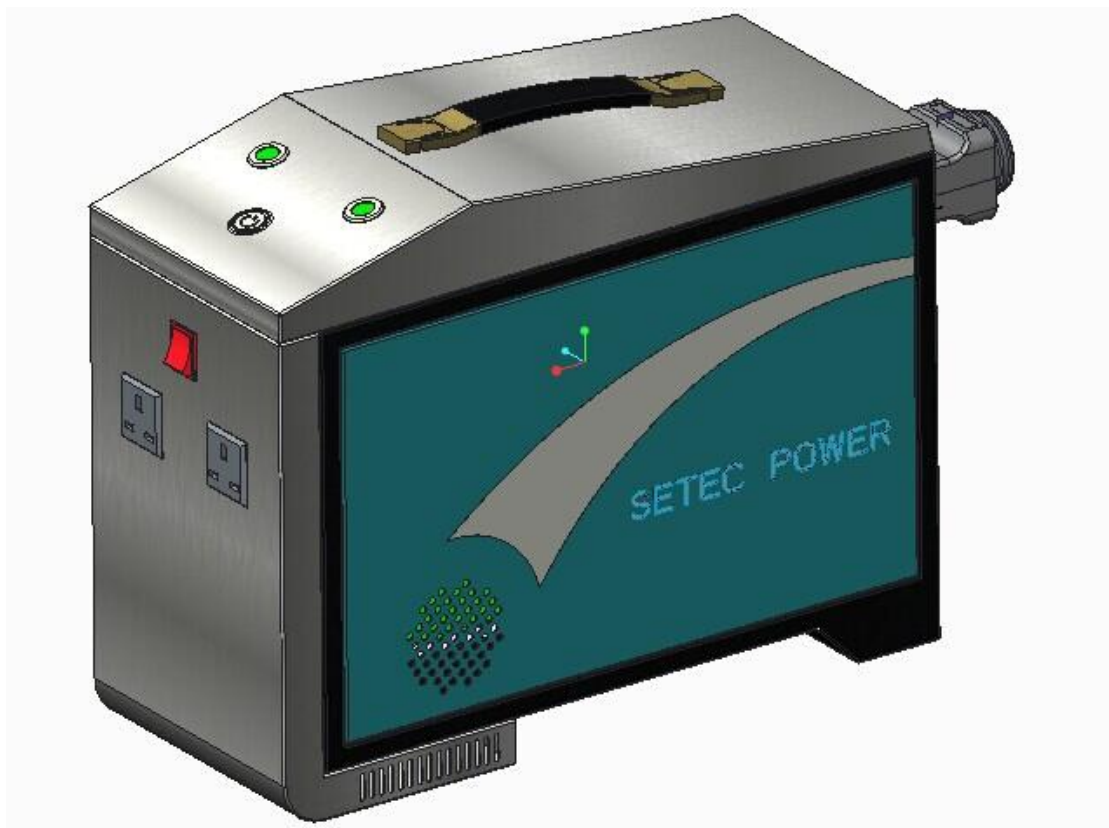
Figure 1. SVH3KW Appearance

SVH3KW converts a CHAdeMO DC voltage into AC voltage to directly charge home appliance by an electric vehicle's lithium ion battery. In addition, the charger utilizes a CHAdeMO compliant communications protocol and power connector.